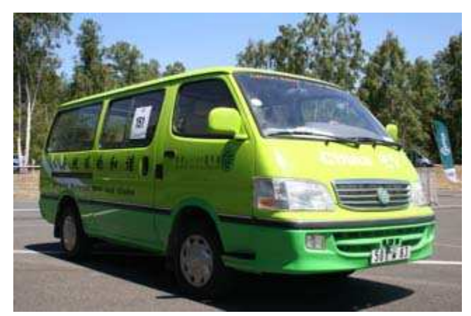
Another electric bus, with lithium ion batteries, from China

A significant Australian connection to the Bibendum Event is the agreement for Greenfleet to plant trees in Australia to offset the carbon emissions of the Challenge Bibendum entrants.