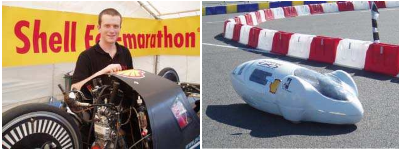
The winner of the 2006 Shell Eco-marathon

In the afternoon there were demonstrations of new technologies including low rolling resistance tyres, dynamic stability systems, and safety systems. There were also demonstrations of the FormulaZero go-kart and of two Shell Eco-marathon vehicles. The FormulaZero cart was fast and silent---the only noise was the squeal of the tyres.