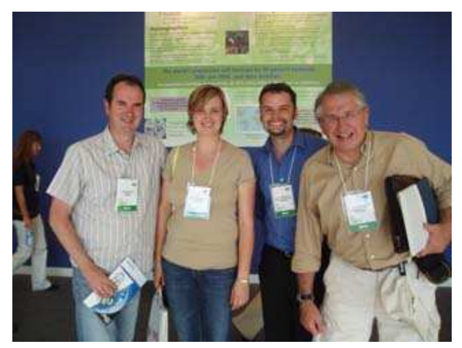
The Australian contingent

Most of the day was taken up by conference sessions, and ride and drive sessions of the various vehicles.