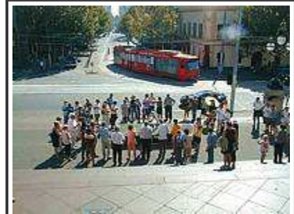
Day 24, 5:15PM -Parliament House, Melbourne. (click for a larger image)