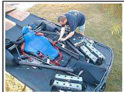
Day 24, Leaving Bordertown (SA). (click for a larger image)

The final stop was Ballarat. The temperatures reached the high 30s and in the solar car itself the readings reached 46 C.