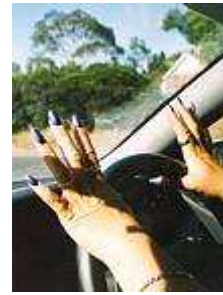
Day 24, Theresa did damage 1 nail! (click for a larger image)