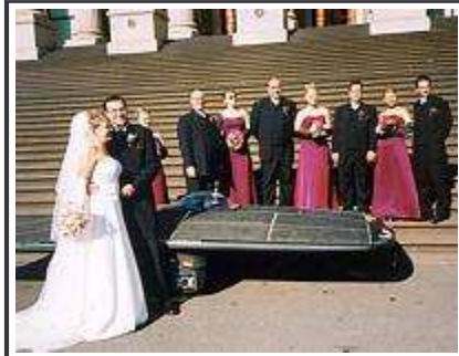
Day 24, Finish at the "wedding steps", Parliament House, Melbourne. (click for a larger image)