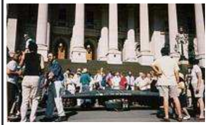
Day 24, The distance record - 13,054 km - ALL DONE!! (click for a larger image)