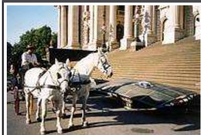
Day 24, A pair of 2 horse power machines. (click for a larger image)