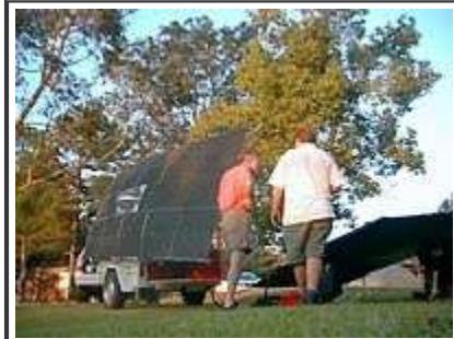
Day 2, Bulahdelah caravan park (click for a larger image)

Finally the team reached its second stop at Wyong only to face difficulties with the draw-bar of the solar car trailer. Some quick repairs were needed. Rafael was in the driver's seat through a holiday traffic jam north of Raymond Terrace but dealt with this in true Mexican style....by breaking into song . Cielito Lindo was the tune, meaning 'pretty sky' which did describe the conditions coming into the overnight stop in Buladelah. Sylvia Seldon is quickly mastering the telemetry work in the lead car but did not record the music.