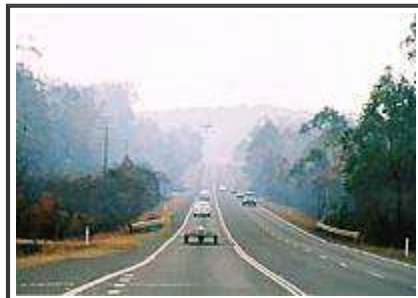
Day 2, Smoke filled skies (click for a larger image)