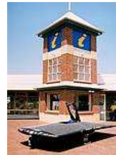
Day 2, Aurora-RMIT 101 solar car at Mittagong information centre (click for a larger image)